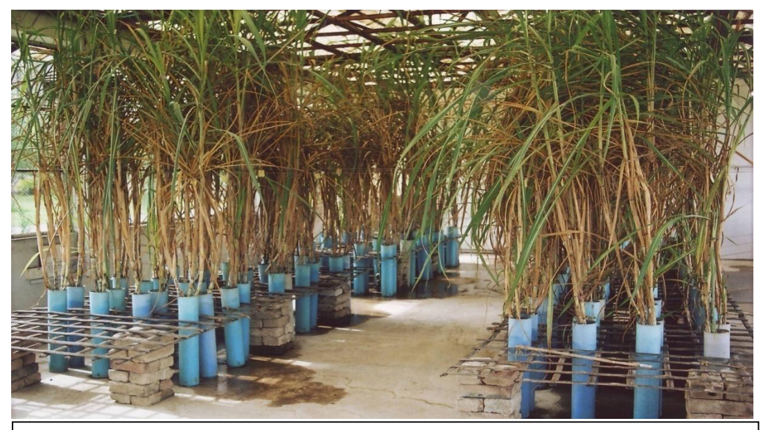
Pictorial view of the experiment conducted under induced drought stress to develop drought tolerant varieties using PEG 6000

2. Screened Water-logging Tolerant varieties