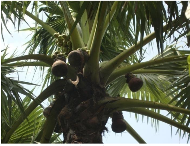
Palmyra palm garden at BSRI