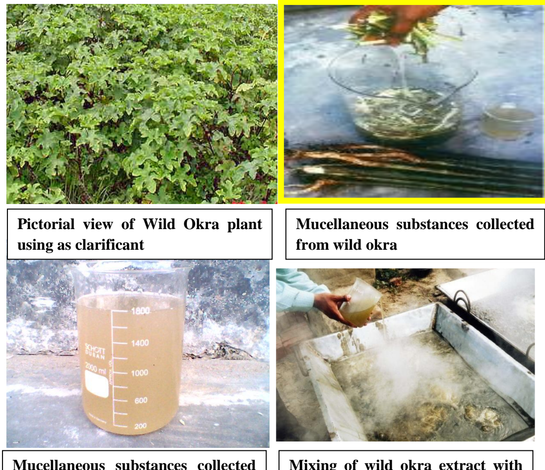
Mucellaneous substances collectedOtfrom wild okra