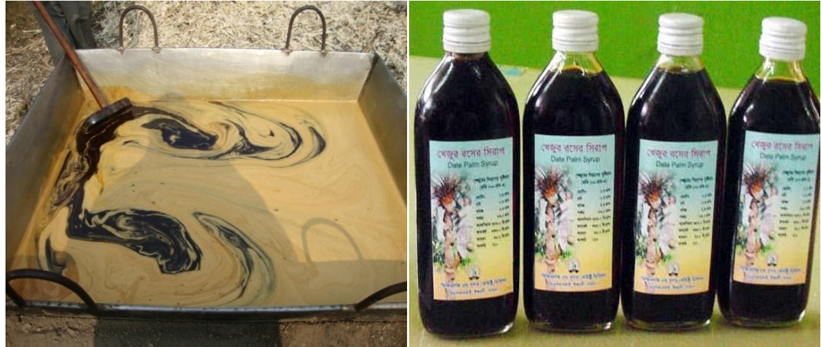
Date palm syrup prepared from date palm juice Bottling of date palm syrup