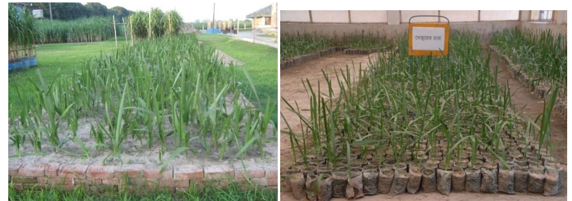
Production of palmyra palm seedling