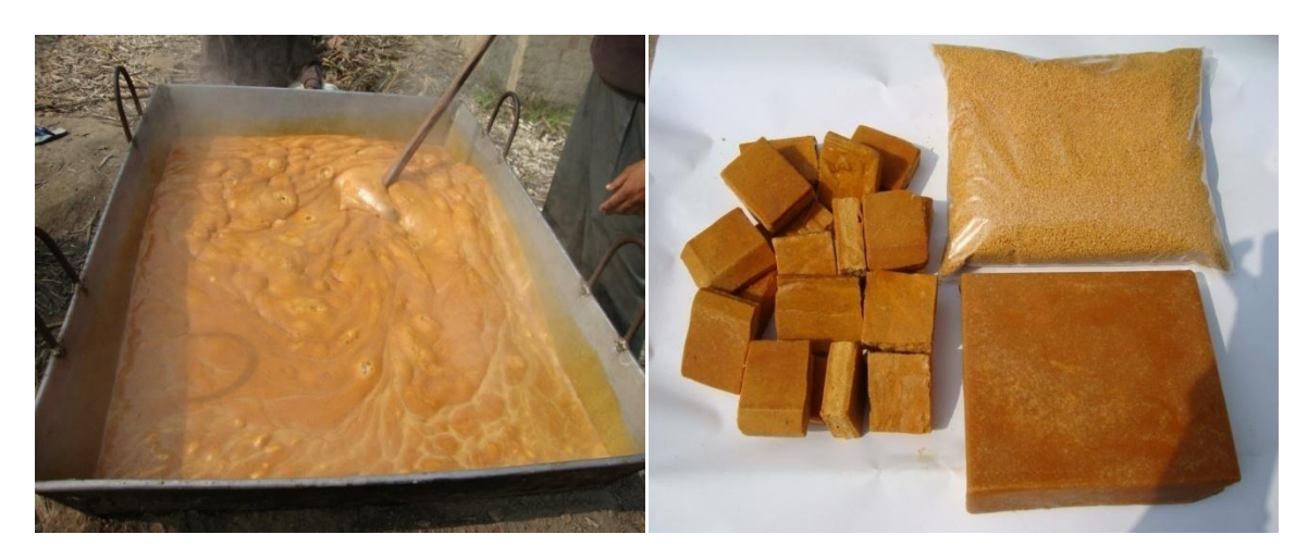
Preparation of date palm gur